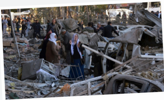
Car bombing in Turkey November 4