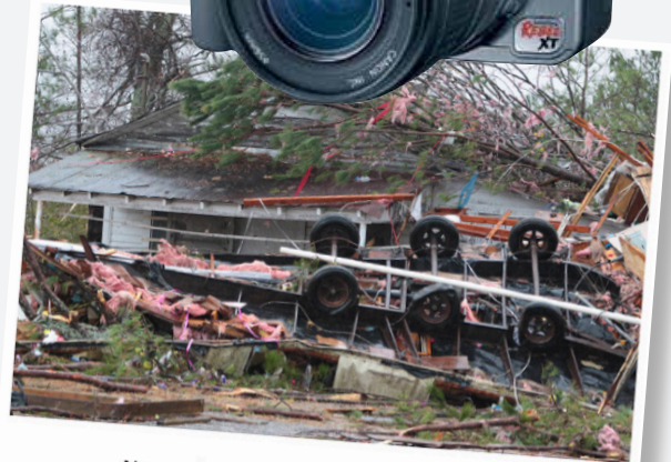
November 30 southern US tornadoes