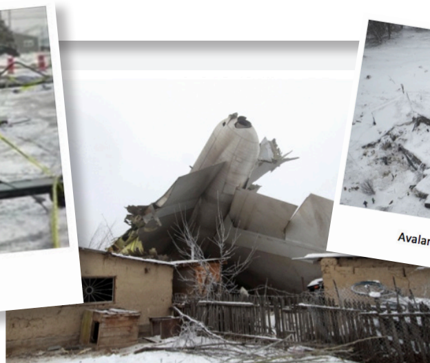
Cargo plane crash Kyrgyzstan January 15