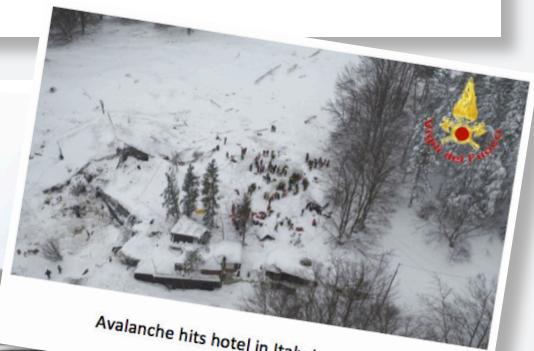
Avalanche hits hotel in Italy January 18